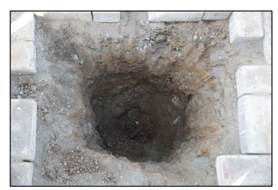
Step 6: Dig a hole at proper dimensions:

This chapter applies for ground installation only.